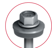
Self-drilling screw JT3-6-5.5